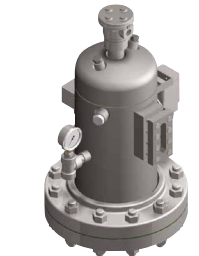
AES-FV™ available: This Flanged Vessel can be split to administer efficient cleaning.

Barrier & buffer fluid systems for use with double mechanical seals. AESSEAL® supplies an extensive range of barrier and buffer fluid systems for use with double mechanical seals. Wherever possible AESSEAL® prefers to supply both the seal and the system. In addition the company will suggest suitable barrier or buffer fluids for most applications, based on extensive field experience. AESSEAL® accepts no responsibility for any problems associated with system design, installation, operation, or the use of an unsuitable barrier or buffer fluid, where the fluid, seal or any part of the system have not been specified and / or supplied by AESSEAL®